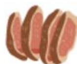
Tenderloin 40 AED