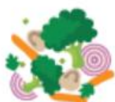
Veggies 30 AED