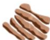
Lamb 40 AED