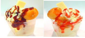
CHOCOLATE PUFF OR STRAWBERRY PUFF