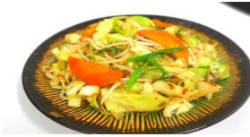
STIR FRIED VEGETABLE